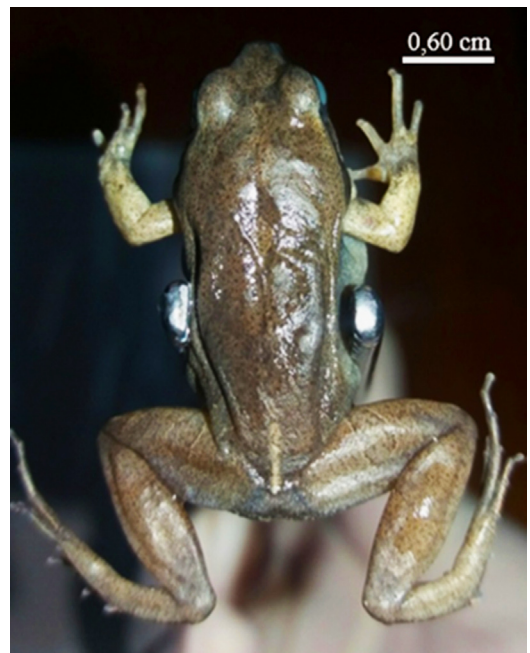
Figure 1. Dorsal view of an adult specimen of Physalaemus albonotatus collected in the Emas National Park.

We identified the specimen based on morphological visual characters (Lobo, 1993; Kehr et al., 2004), such as dark grey coloration (Fig. 1) with discrete dark horizontal stripes on the legs and a whitish ventral colour (Fig. 2). We also measured morphometric characteristics for the collected individuals with a calliper (nearest 0.05 mm) following Brasileiro and Haddad (2015) (Table 1).