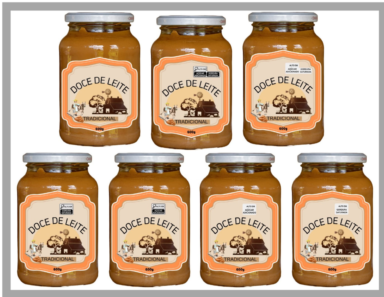
FIGURE 2 | Hypothetical products evaluated in the discrete choice experiment.