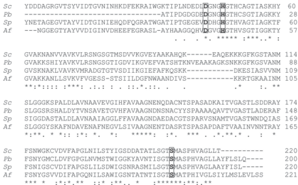
Figure 4. Alignment of the deduced amino sequence of Paracoccidioides brasiliensis serine protease (AY319300), family S08A to related sequences. Black boxes and bold letters show conserved residues of the catalytic triad DHS, well described in this family. The sequences aligned were obtained in MEROPS database: Sc , Saccharomyces cerevisiae (P09232); Pb , Paracoccidioides brasiliensis aminopeptidase; Sp , Schizosaccharomyces pombe (P78879); Af , Aspergillus flavus (P35211).

Among the identified serine proteases a Kex2 endoprotease was identified (Table 1). The Kex2 endoprotease presented the highest identity to the Kex2 gene of P. brasiliensis described elsewhere (Venancio et al., 2002).