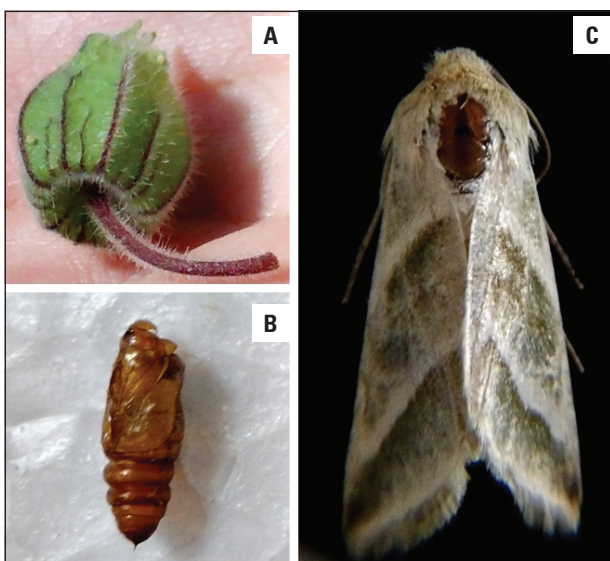
Figure 2. Chloridea (Heliothis) subflexa eggs (A), pupae (B) and adults (C), found on Physalis peruviana .

specifically in the wings where the basal region has a lighter color than the medial region (Poole et al. , 1993). The key traits in distinguishing C. subflexa from C. virescens are related to the prothoracic tibia and palps (Poole et al. , 1993).