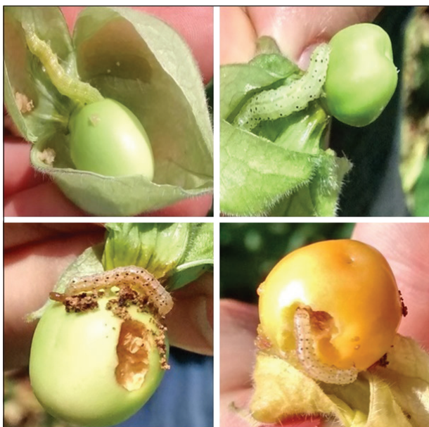
Figure 1. Larvae of Chloridea (Heliothis) subflexa in Physalis peruviana fruit.